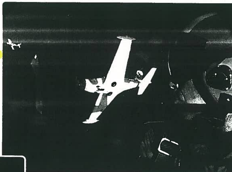
HE'S ON YOUR SIX: Air Combat USA (above) and Fighter Combat International (left) let you experience a dogfight

If this sounds like your cup of high-octane tea, look for a program that will keep you